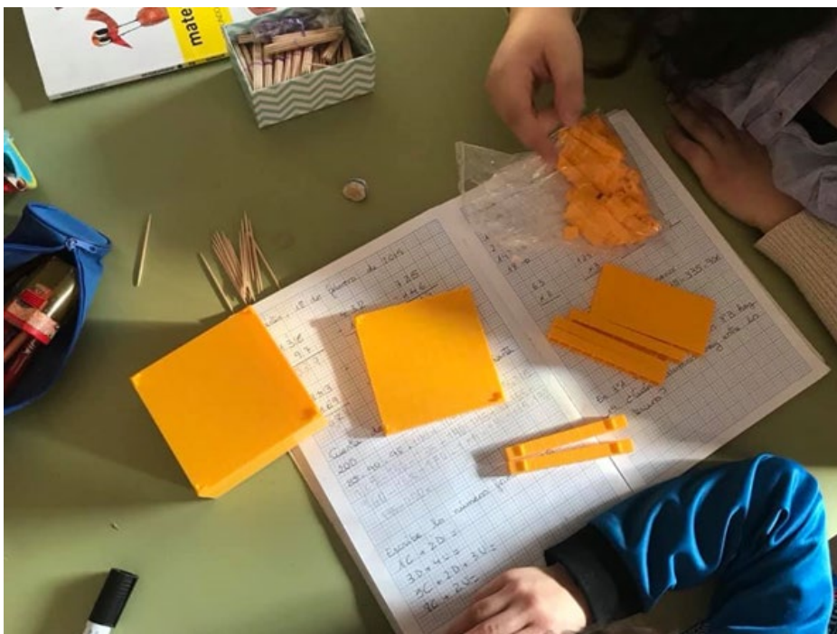
Figure 2. Project Implementation

Note. Visual depiction of the actual implementation of “Aula de Apoyo” where undergraduates provide weekly math support to primary students. Materials such as multibase blocks or other manipulatives are showcased, along with the roles of both tutors and tutees during the sessions.