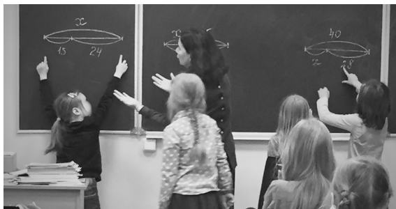
Figure 2. The teacher signals “I don’t understand.” Some of the students give an explanation and the teacher signals that she does not understand by lifting her shoulder and holding out her hands in a questioning gesture as she says: “Can that be?” or “Is this right?”

in the drawings. Using what can be seen as an imaginary playful format she then asks students to examine the structure in more detail: “You know, one boy from another class said one thing... He said that he thinks that two drawings are much more similar to each other than the third one. Which one is different?” During this sequence, several students come to the board simultaneously – all engage in explaining and arguing. Some students work together with the teacher, and some work in pairs (Figure 2).